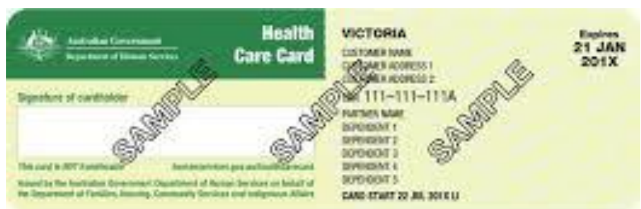
Health Care Card