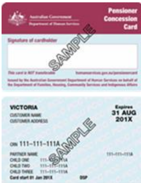
Pensioner Concession Card

Please ensure you have the relevant card on you when you visit the office.